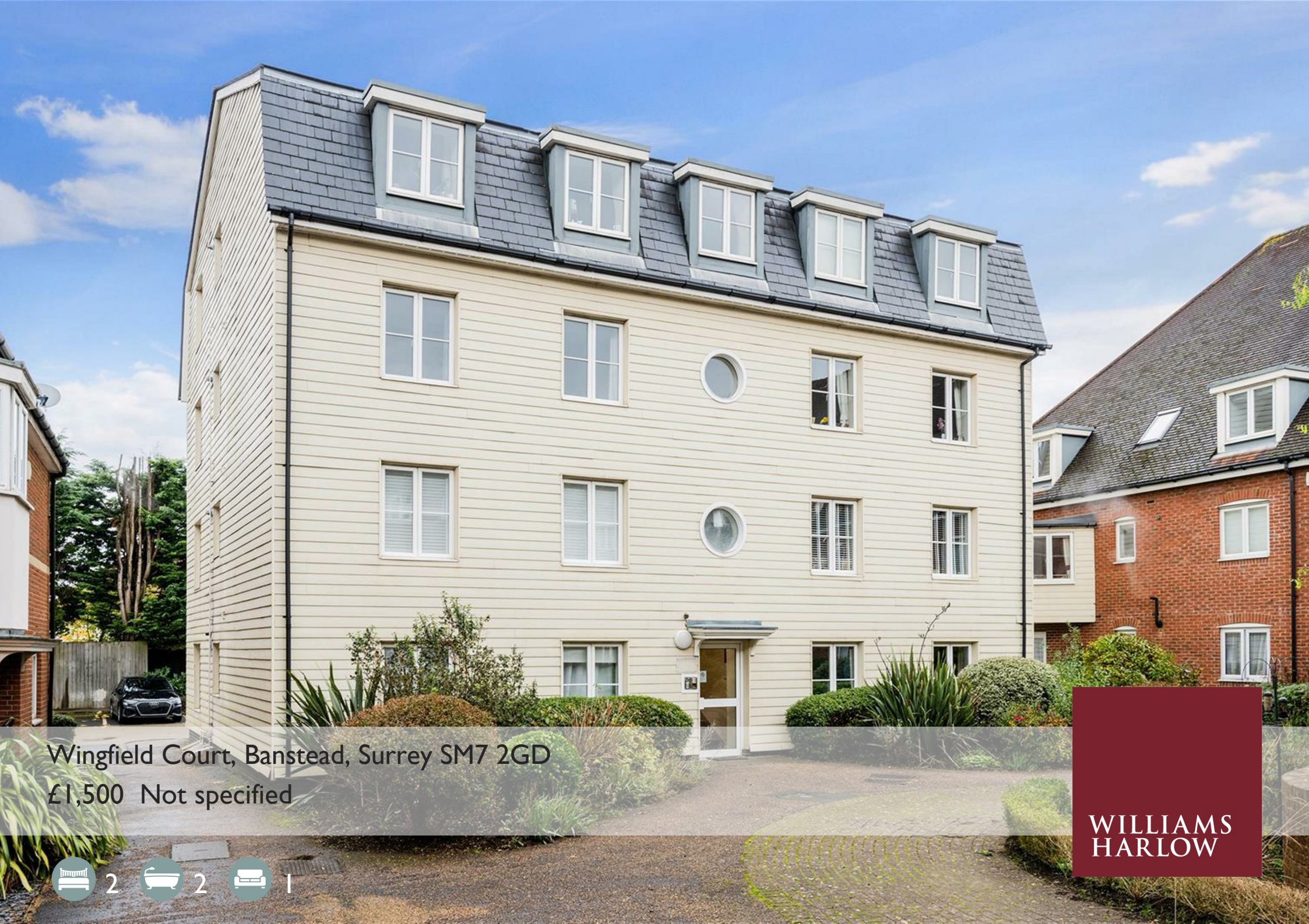
Wingfield Court, Banstead, Surrey SM7 2GD £1,500 Not specified